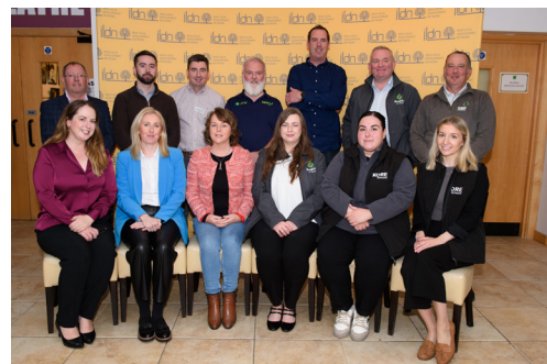
Local Development Companies representatives at the Retrofit Ready Mid-Term Conference in Castleblayney.