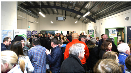
A large crowd attending an Virginia Energy Event in Virginia, Co Cavan.

Contractors are also in attendance at the events to give attendees expert knowledge on various retrofitting options and the products they will require to complete the works.