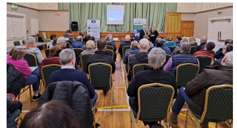
Glaslough in Monaghan attract an interested audience